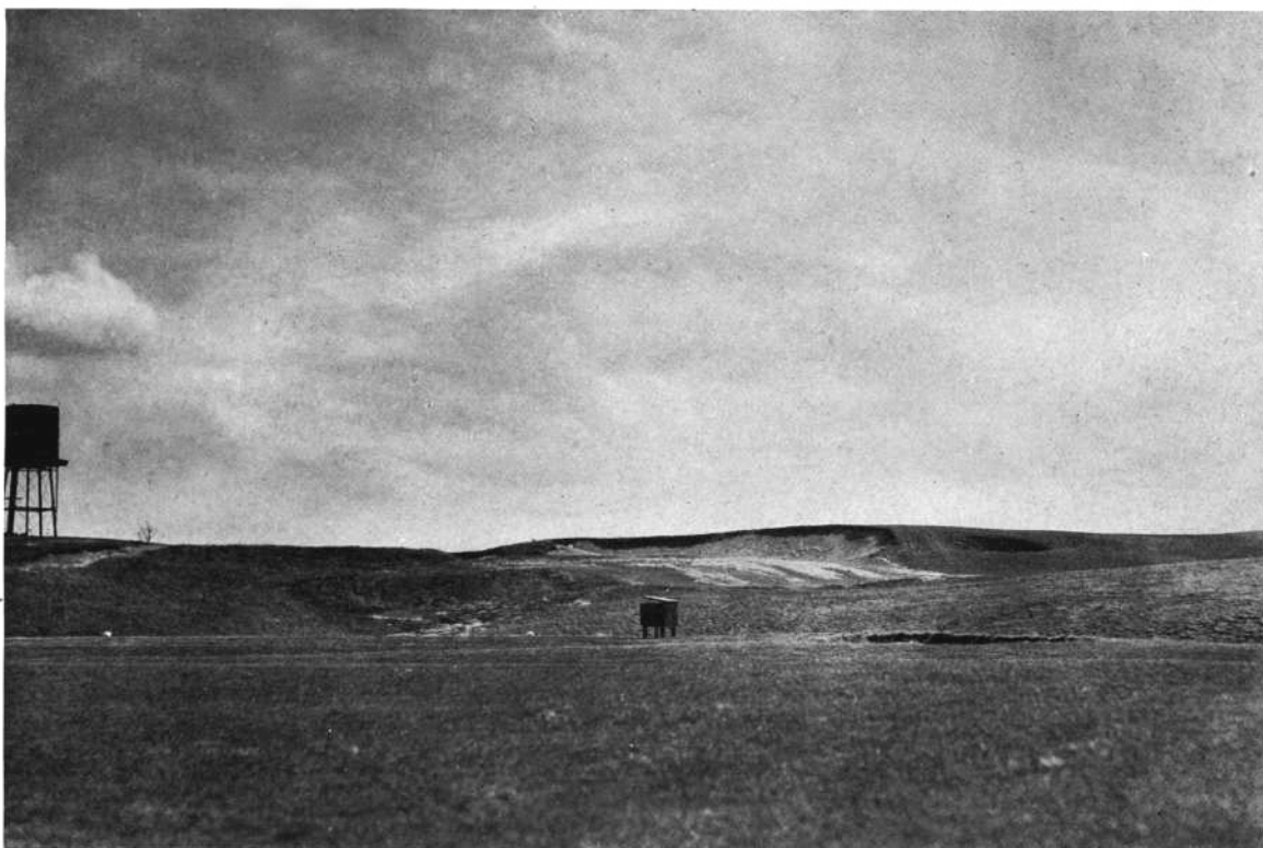
No. 1. The Sahara hole from the tee. The direction of the green is just over the left-hand corner of the diagonal bunker, a carry of 190 yards

Described by C. B. Macdonald and H. J. Whigham