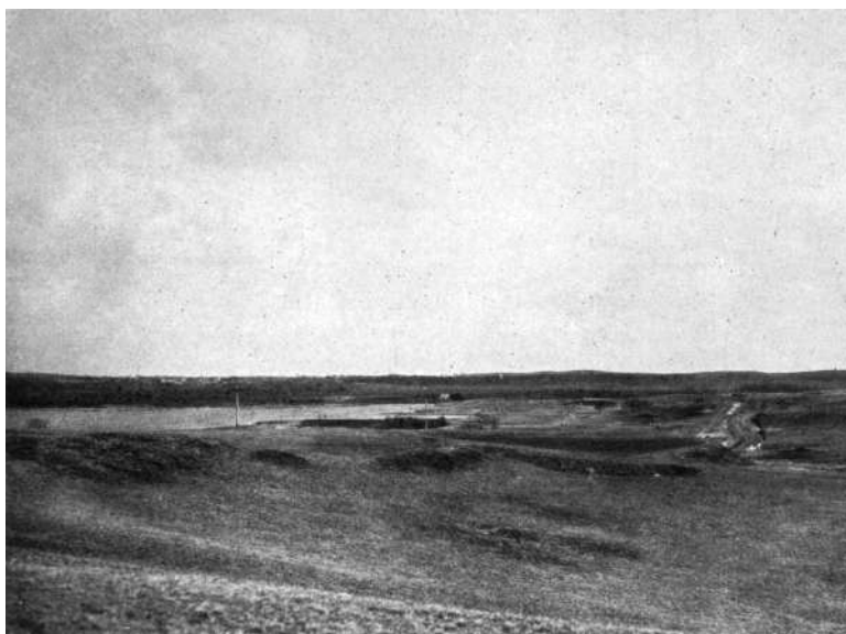
No. 3. The Sahara green as seen from position and direction of arrow 3 on the model

because the second shot for the player who makes for safety is far more difficult. At Sandwich any sort of shot played well to the right leaves the player with an easy run up to the green, so that he has a chance of a possible three and a fairly simple four. At the National the second shot is always difficult unless the big carry is made; in fact, a fairly good tee-shot (Continued on page 47)